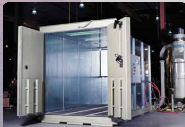
Air Blast Rooms