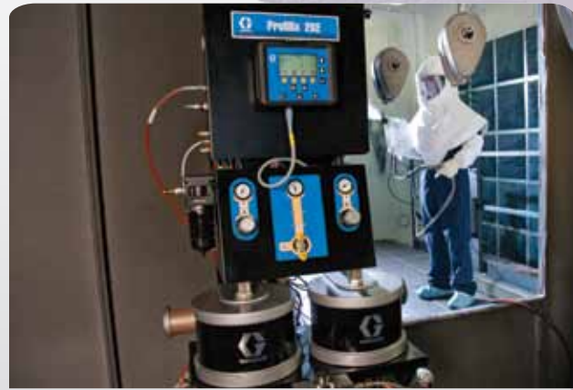
Plural Component Pump Systems

ICAFe's highly trained and innovative engineering and sales specialists, along with our world-class suppliers, are able to provide products of utmost quality. Our proven performance, high standards and reliability has made us the industry's leader.