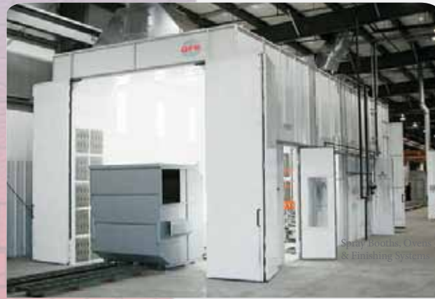
Liquid Paint Booths and Air Makeup Systems